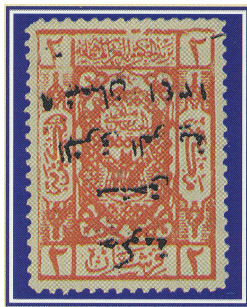
2p with inverted handstamp