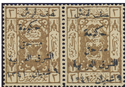
Normal in pair with handstamp double