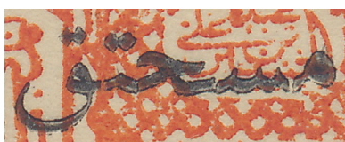
Ink squash (on مستحق error)

It is quite common for this overprint to show signs of 'ink squash' caused by the pressure exerted by the typographic process. Ink is forced from the centre of lines to the edges.