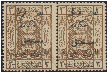
Normal (position 1) in pair with transposed characters (position 2)