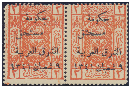
Pair from positions 1 (normal) and 2 (transposed characters)

Various catalogues list many printing varieties: