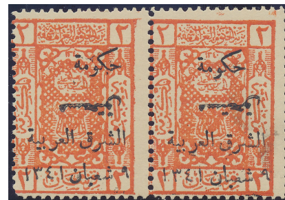
Overprint inverted, one with transposed characters