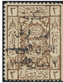
Inverted overprint, surcharge at centre