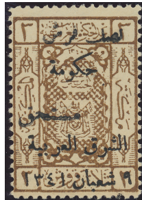
Normal, surcharge at top