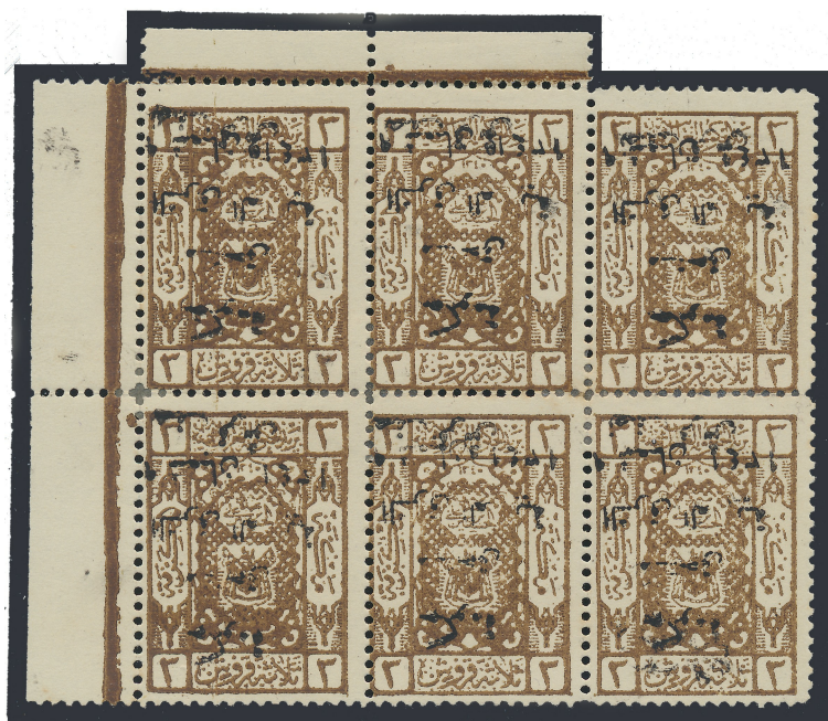
All handstamps inverted