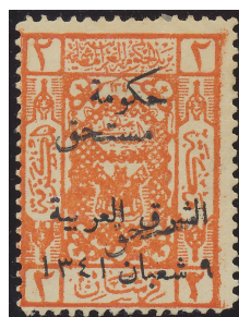
Overprint double, one diagonal