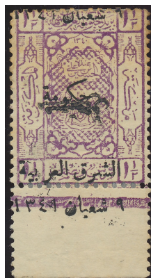
Overprint double, both inverted (right)