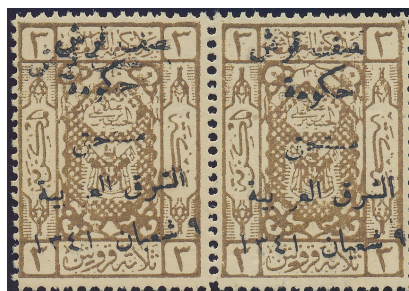
Surcharge double in pair with normal