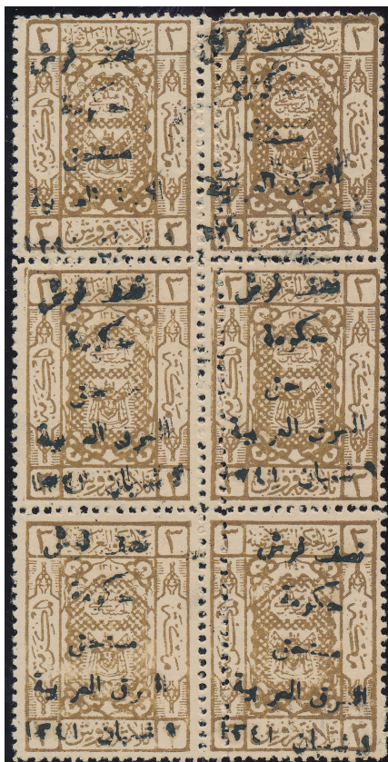
Block with top-right stamp having the handstamp applied double.