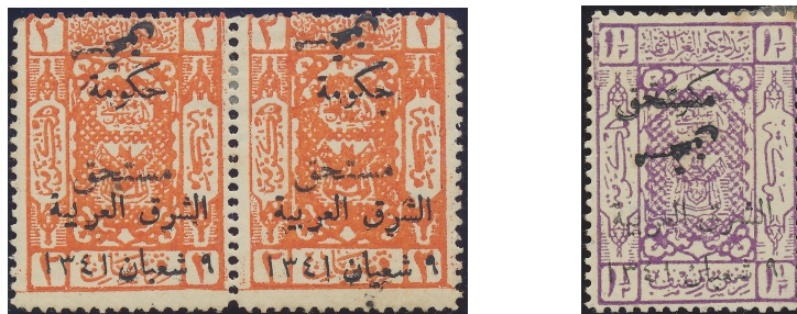
Inverted forgery used to create the error 'overprint double, one inverted'

This forgery appears to have been used to create double-overprint errors from genuine single-overprint stamps. Other examples are illustrated in Najjar 1 .