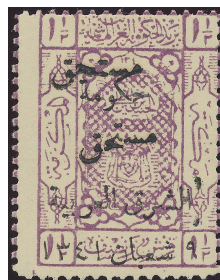
Upright forgery used to create the error 'overprint double'