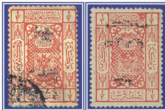
1 Overprint double on the typographed overprint.

Najjar 3 also illustrates an inverted overprint and a double; see below.