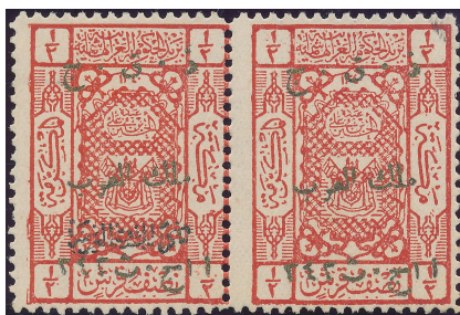
Forgery in pair with overprint omitted

This forgery has only be seen on a King Hussein visit forgery and could even be part of a single overprint plate used on that issue.