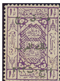
Note 1924 (January) overprint omitted