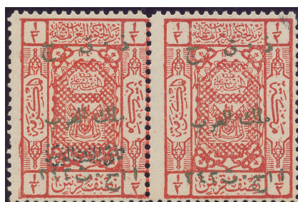
Pair of forgeries, one with 1924 (January) overprint omitted